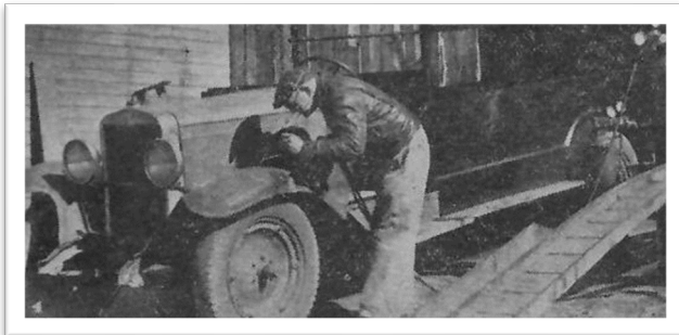
Fire Trucks Then