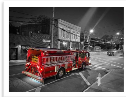
Fire Trucks Now